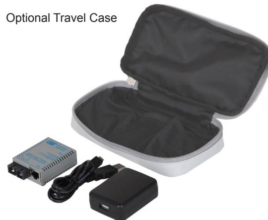
Travel Case has individual pockets to hold the converter, cable and power adapter.

miConverter is a trademark of Omnitron Systems Technology, Inc. Specifications subject to change without notice. © 2011 Omnitron Systems Technology, Inc. All rights reserved.