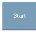
2. Press Start