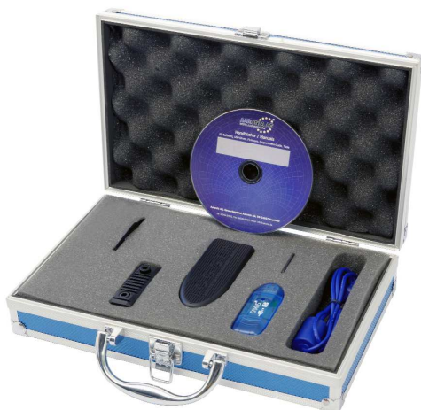
Scope of delivery