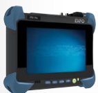
Platform FTB-1 Pro