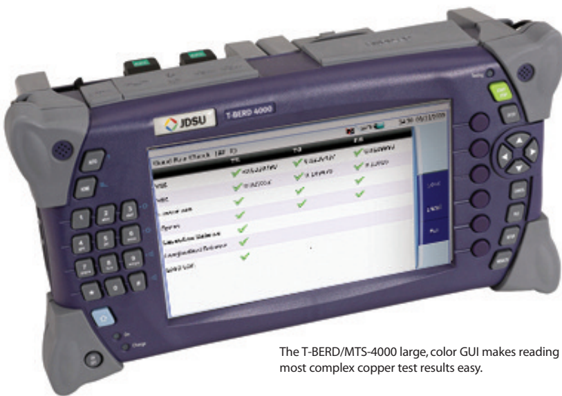
The T-BERD/MTS-4000 large, color GUI makes reading even the most complex copper test results easy.