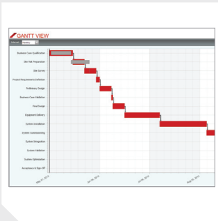
iBwave UNITY ENTERPRISE, project workflows