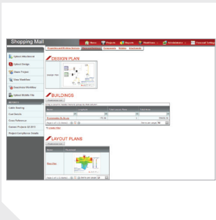
iBwave UNITY ENTERPRISE, detailed project information