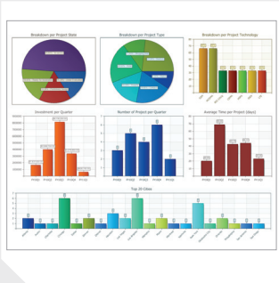
iBwave UNITY ENTERPRISE, dashboards

The application of information is the pivot upon which sound business decisions are made, and iBwave Unity Enterprise delivers unprecedented intelligence on in-building projects. Who is doing or has done what, where and when is all available at the click of a mouse, giving real-time visibility into every aspect of a project by any member of your team, from RF engineers, to management, finance, or third-party system integrators.