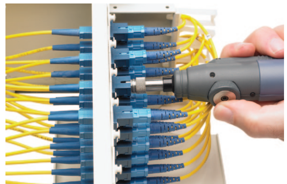
Patch panel bulkhead inspection