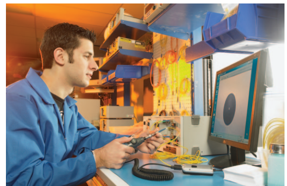
Patchcord inspection in a manufacturing environment