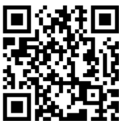
Figure 4-1: QR code to the Rohde & Schwarz support page

Contact our customer support center at www.rohde-schwarz.com/support , or follow this QR code: