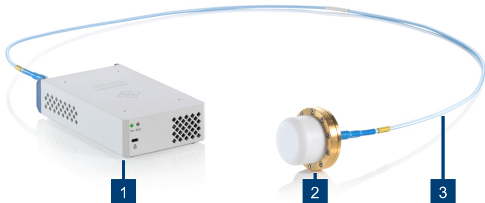
Figure 3-1: R&S TSMS-OMN70 connected to R&S TSMS53DC

Figure 3-1 shows the connection to R&S TSMS53DC. You can connect the R&S TSMS-OMN70 to R&S TSME6 or R&S TSMA6B in the same manner.