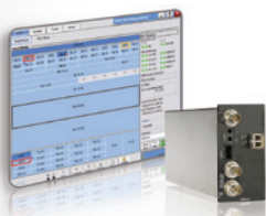
SONET/SDH Test Modules FTB-8115 – FTB-8120 FTB-8130 – FTB-8140