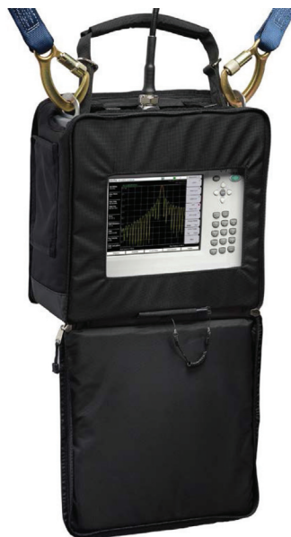
SOFT CASE OPENS IN FRONT FOR EASY ACCESS AND USE.