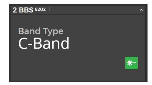
Figure 2 - mBBS MAP-300 summary view GUI

An intuitive graphic user interface (GUI) is optimized for use in either a laboratory or a manufacturing environment. Efficient transition between summary and detailed views (figure 2) allow users to operate at a system level or access the full power of a module.