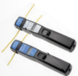
Live Fiber Identifier/ Tone Generator LFD-300B/TG-300B