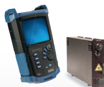
Compact Platform FTB-200