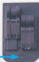
Ball allowing the adjustment of the compartment door