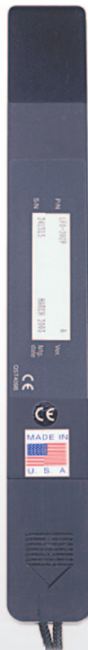
Adapter heads compartment (door open)